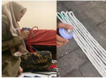
Figure 11. Finishing process