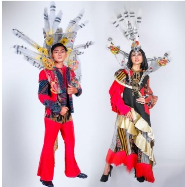
Figure 14 Couple's Collection 3

The fourth artwear pair (Figure 15) is the "highlight" of the entire collection. This artwear pair exudes elegance with a modern and luxurious touch. The modern touch of fabric manipulation surface design gives a dashing impression. The ethnic impression of the fourth look was emphasized by the application of headpieces and accessories that presented the new capital icon and ethnic characteristics of Borneo's motifs. The combination of red and black, along with woven motifs, and the inclusion of headpieces and body pieces in this pair's collection, further emphasizes an impression of majesty, charisma, and a powerful auraces in this couple collection, further emphasized the impression of majesty, charisma, and positive vibes