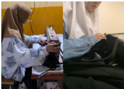
Figure 7 Sewing process