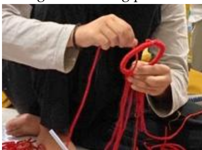
Figure 9. Detailing process