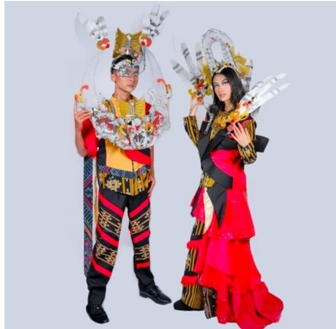
Figure 13. Couple's Collection 2

The second pair of artwear (Figure 13) features more ethnic and futuristic shapes. This is characterized by the weaving material, pattern design, and surface techniques used. The combination of red, black, and gold colors, complemented by a body piece, shoulder piece, and headpiece in the shape of a capital building icon, makes this collection futuristic, luxurious, and unique.