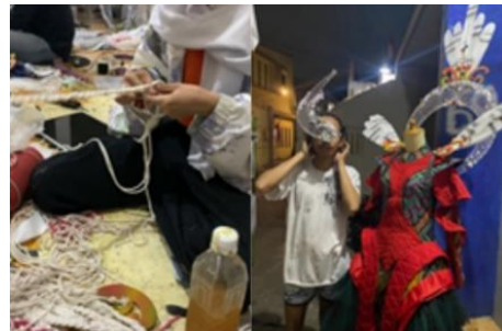
Figure 8. Accessories making process