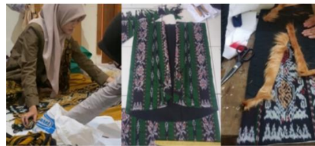
Figure 6. Cutting process of fabric materials.