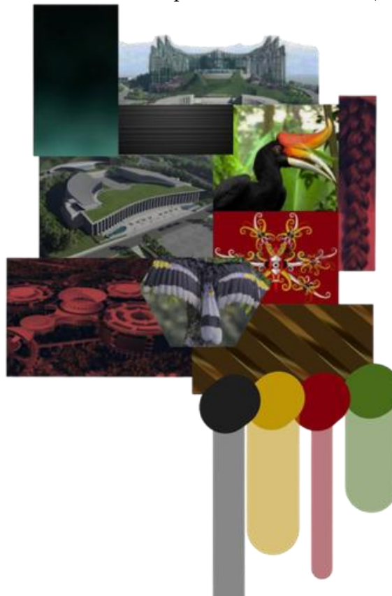
Figure 2: Inspiration Moodboard (The Garuda Building of IKN, Hornbill/Enggang Bird, Traditional Kalimantan Motifs/Ornaments (Pakis Motif), Colors of Traditional Kalimantan Cultural Artifacts)

As explained earlier, the inspiration for this work is the hornbill , which mythologically has meaning for the Dayak tribe in Borneo. The idea is then expressed in the concept of the work, including aspects of content, form, and presentation context. The work's content (content idea) comprises the values or messages that are to be conveyed in this work, namely that the hornbill can be used as a source of ideas for creating artwear that contains cultural values. The content is then visualized in an inspiration mood-board (Figure 2)).