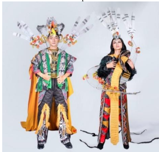
Figure 12. Couple's collection 1

The test involves the evaluation of the structure, composition, color, and form of ornaments representing Bornean culture, as well as the comfort of the garments when worn by the models. After the concept was formulated, the next step was the design process, which involved transforming the concept into design sketches until the line collection was finalized (Figure 12). The Bornean cultural elements in this pair of art costumes are clearly visible in the headpiece and shoulderpiece. The headpiece's shape is inspired by the hornbill's beak and is decorated with hornbill feathers. The shoulderpiece also features a fern leaf motif carving