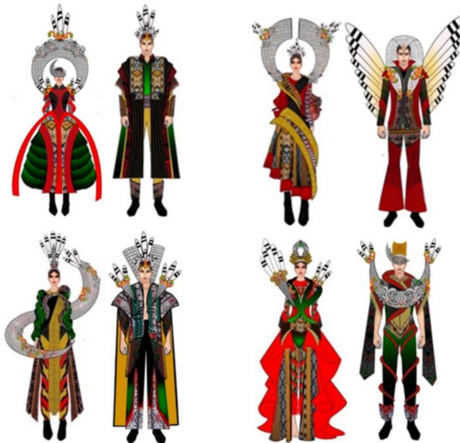
Figure 4. Line collection

The method of making carnival fashion works is adapted to the characteristics of the creative object—namely artwear—without sacrificing the essence of the values, functions, and meanings of Bornean culture. This approach resulted in four pairs of art garments, each with one male and one female design. Although each piece is uniquely designed, they share the same visual language regarding the color palette, materials, and iconic accessories.