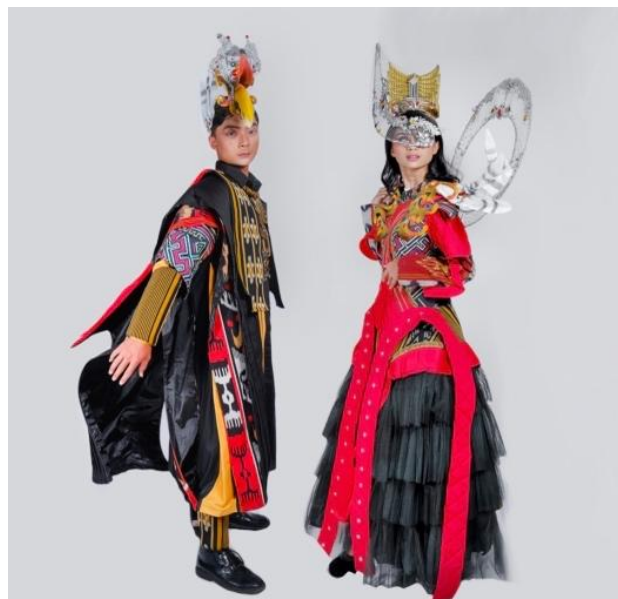
Figure 15: Couple's Collection 4

The fourth artwear pair (Figure 15) is the "highlight" of the entire collection. This artwear pair exudes elegance with a modern and luxurious touch. The modern touch of fabric manipulation surface design gives a dashing impression. The ethnic impression of the fourth look was emphasized by the application of headpieces and accessories that presented the new capital icon and ethnic characteristics of Borneo's motifs. The combination of red and black, along with woven motifs, and the inclusion of headpieces and body pieces in this pair's collection, further emphasizes an impression of majesty, charisma, and a powerful auraces in this couple collection, further emphasized the impression of majesty, charisma, and positive vibes