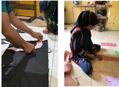
Figure 5. Pattern-making process

The third stage is a continuation of the design process, which involves transforming the master design/line collection into actual garments. In this stage, eight steps are taken: model measurement, pattern making (figure 5), fabric cutting (figure 6), sewing (figure 7), accessories making (figure 8), detailing (figure 9), fitting (figure 10), and finishing (figure 11).