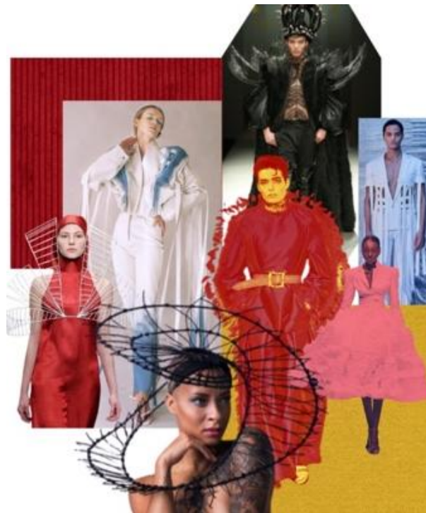
Figure 3. Style Moodboard

The ' idea form ' represents the visual concept of a work, typically laid out on a mood board (Figure 3). This board comprises a combination of visual elements—such as silhouettes, styles, colors, textures, materials, weaving techniques, and folds—that collectively guide the work's final form. The significance of this mood board lies in its role as a crucial medium for designers to effectively develop and articulate their visual ideas (Bestari and Ishartiwi, 2018: 124).